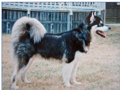
The escape artist at six months old.