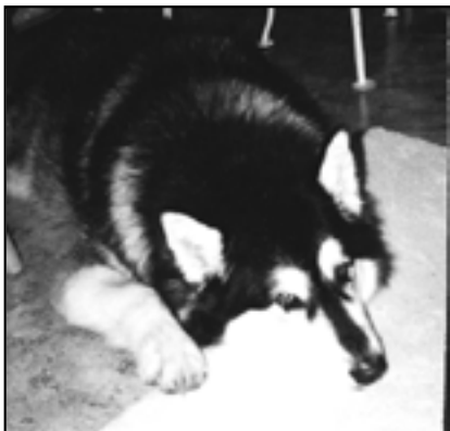
Bigby hangin' out.