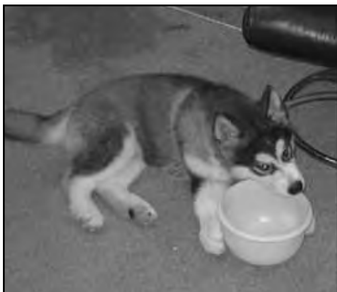
Please sir, can I have some more?

Updates to this event calendar will be made when the required AKC paperwork has been received from the Show Chairs and submitted to AKC for their approval by the Vice President.