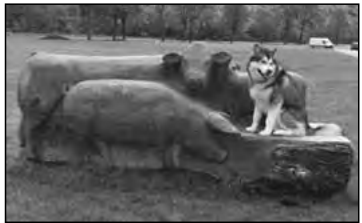
I think they forgot a very important part of this sculpture don't you?