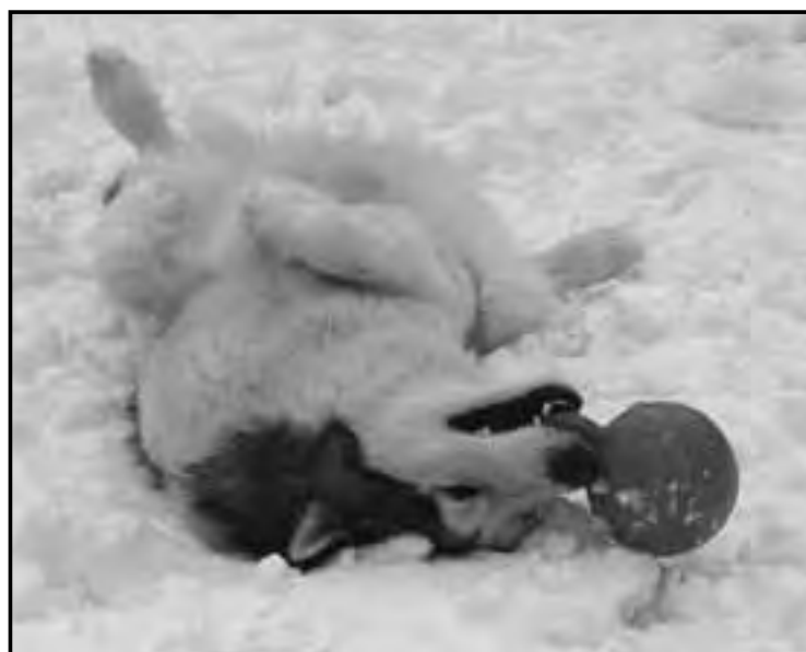
My tongue is froze to my ball thingy.