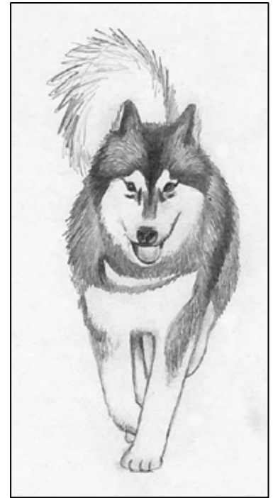
This bitch is single tracking at a brisk trot.

Certain breeds exhibit a modification of single tracking (although the same principles of movement and gravity hold for all dogs, of course). These dogs—short-legged breeds, longer-bodied breeds, and special-front breeds—should demonstrate footfalls that incline toward the midline. This is accomplished without the elbows flaring out, but kept in close to the dog's body. The center of gravity in the body thus gives the impression of slightly greater width from right to left rather than seeming to be a perfectly static point, as seen in the more narrow-bodied dogs.