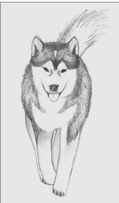
This dog is single tracking at a brisk trot.

Every animal is affected by gravity during movement. Animals in the wild must use it to their advantage in order to survive. Any deviation from proper single tracking produces fatigue, body stress, and eventual structural damage to a greater or lesser degree, dependent on the degree of fault. To see a perfect single-track gait, one only has to watch a large animal, such as an elephant, walking. If an elephant did not employ single tracking during very long treks, his tremendous weight would quickly break down the shoulders and give way to lateral displacement. Both these consequences would result in a very quick susceptibility to predation—and an early demise.