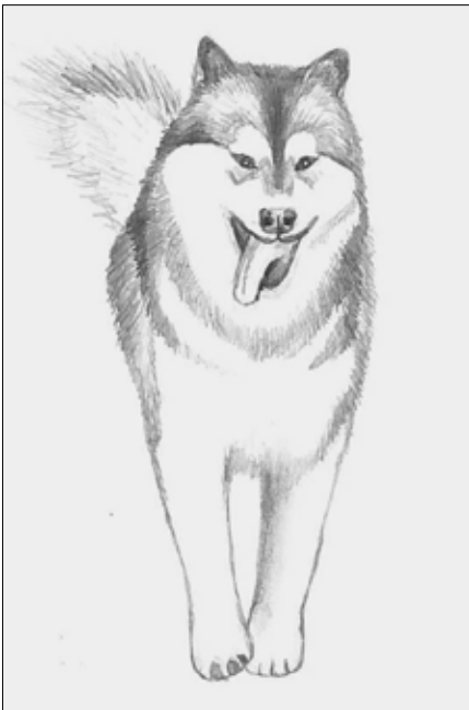
This bitch is converging toward the centerline.

Submitted by the Breeder Education Committee