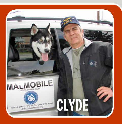
them, that from now on only good is going to happen to them - because they're with WAMAL and mal rescue.

Some are quite normal and well behaved, some fairly wild and untrained, and then there are the ones scared spitless that curl up in a ball at the very back of the car and have that wide-eyed look, "What is gonna happen to me now?" And you try to reassure