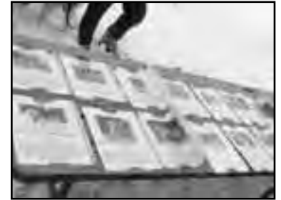
Top Pic: At each station we have info cards. Bottom Pic: The info fliers for each participating dog.