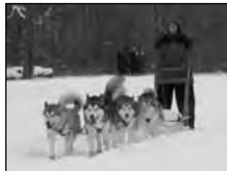
The end of day run with five dogs. Note the horse drawn carriage in the background.

We also make a sheet for each dog with call name, picture, registered name and titles, age, and a couple fun facts about the dog. To explain the titles on the posters we have an additional sheet off to the side.