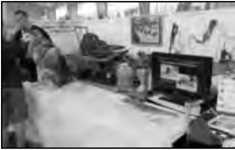
Wisconsin State Fair, Ivy on the table

For those interested in doing something more, keep an eye out for fall and winter festivals in your area, and ask them if they're be interested in a sled dog demo. Plan to bring all your 'gear', from harnesses to backpacks, to sleds and rigs. Obviously, this is much easier to manage with a club or large group. What we've done is set out everything, and then place dogs here and there for petting. AMCW participates in Harnischfeger Park's winter festival, and they cut us a short loop with a snowmobile. Throughout the day we send out teams from one to six dogs. (The big team only goes out at the end when they're tired because there are horsies nearby). They go around the loop, so people get to see that it can be done with one to two dogs. In addition, for the club members who haven't tried it before, we take two compatible dogs, and let them have a shot at running, while someone from the group explains to the public what we're doing. I think it makes an impact on the public that 1) these dogs innately know how to pull and 2) that even newbies can give it a shot.