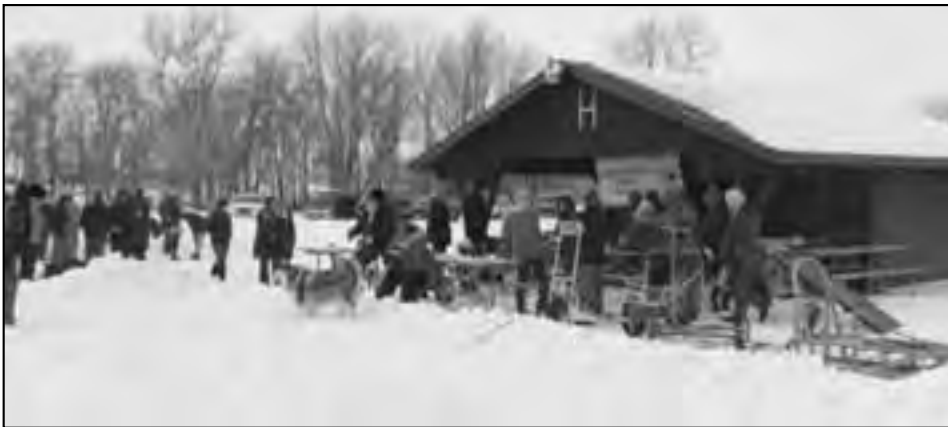
Scenes from the setup. The resting dogs are crated back within the shelter.