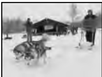
Experimental team #1: puppies Cora and Strydar try it out for the first time!