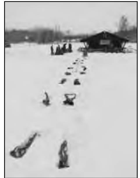
While we do not promote the Iditarod as a common breed activity, we do set out a gangline and harnesses to show the actual length of a 16 dog team. People stand on the sled to get a feel for it. The first time you go back and stand on the runners, it IS impressive.