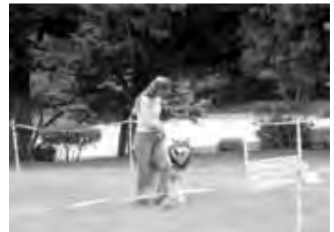
ARWAH with Mary

Things like slow response, out of position and a variety of handler errors result in point loss. The handler may not touch the dog while on the course. The dog must enter and exit the ring on leash and under control. Behavior is "scorable" the entire time the dog is in the ring, not just while on course. Once the dog has completed the RA title, it may display those initials after its name and drop the RN.