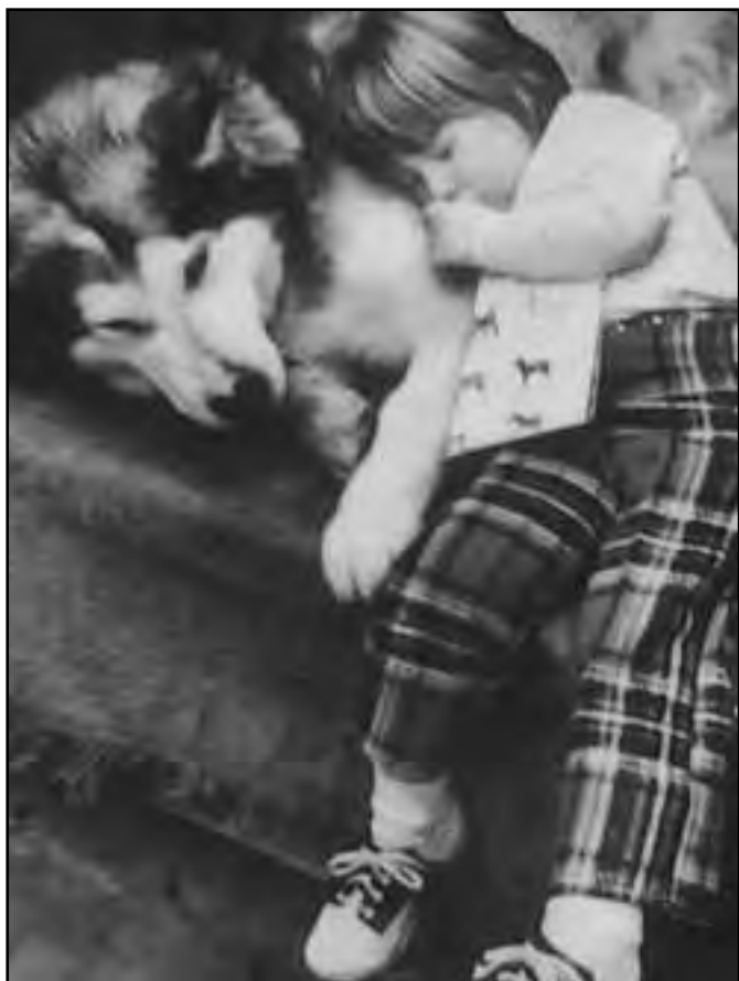
Photo taken by a photo news photographer at the Detroit Kennel Club Bench Show at Cobo Hall in Detroit, Michigan circa 1970.

Wheel Dog Left Side: American / Canadian Ch. Coldfoot Wolf of Sittiak ( Ch. Shuyak Caro of Coldfoot CD x Ch. Coldfoots Chevak)