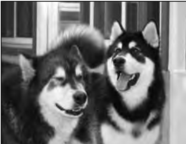
If I have to listen to that story one more time, I'll puke.

If anyone has any questions regarding the requirements or the application process, please don't hesitate to contact me.