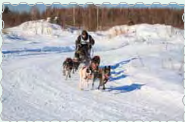
Australian Amanda Byrd competing in 6 Dog Open.