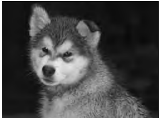
What do you mean I smell like a wet dog? Doesn't a bath in the river count?