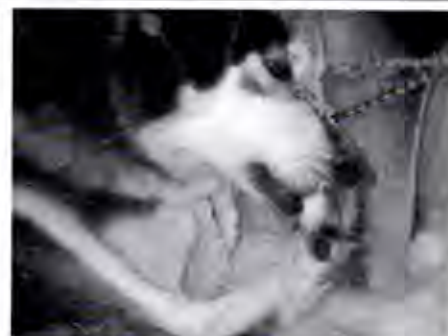
Check any dog with red-stained fur on its feet. Caused by constant licking, red stains usually indicate a problem.

The red stain can persist for days after recovery. It should raise suspicions even if you don't find an underlying problem. If