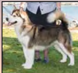
Kasaan Sno Klassic Kiss The Fortune (Howen/Peel)