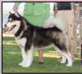
GCH Silverice's Poker Face (Syar/Stone)