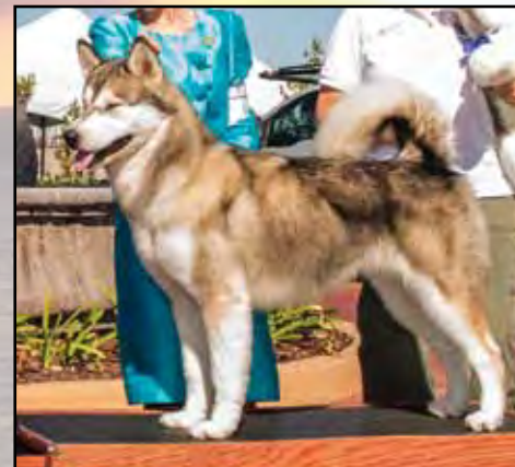
Best in Puppy Sweepstakes: WOLFHOLIC'S TEMPEST OVER- WHELMING (Choi)