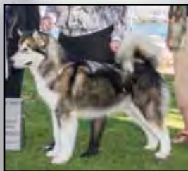
CH Siverice's Sensational Celebutante (Syar/Stone/Kendrick)