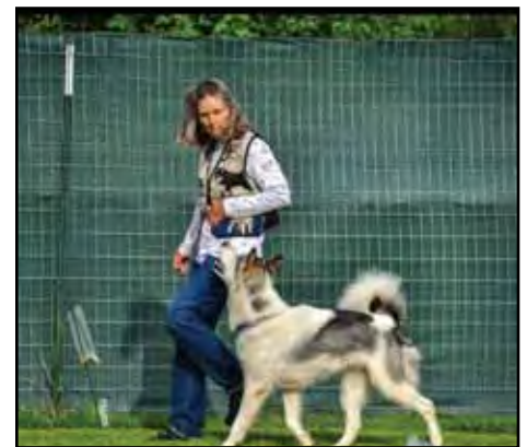
Comet steps back

Excellent exercises include: Halt Stand Sit and Halt Stand Down, Moving Stand Walk Around Dog and Moving Down Walk Around Dog. On both of these exercises the handler should not pause when standing or dropping the dog before walking around. However, as with all walk-around exercises, the handler must pause once back in heel position. There is a Moving Backup Three Steps, where the dog should