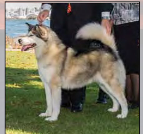
Best in Veteran Sweepstakes: GCH QUINAULT'S TWISTED SISTER WTDX (Baker)