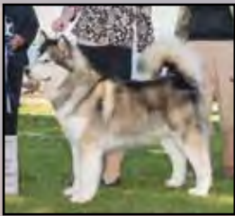
CH Taolan Quest Flying Cloud (Newburn/Pohl)