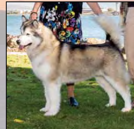
Best Veteran: CH PACH NANUKE'S TAKE IT TO THE BANK CD RN MXGP MJGP T2BP (Corr)