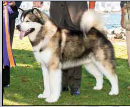
Best of Breed: GCH PEACE RIVER'S GATHERS NO MOSS AT SUNSTRA, (Robinson/Coburn/Syar/Robinson.)