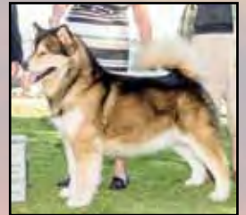
GCH Mytuk's Technical Knock Out CGN (Milburn/Clark)