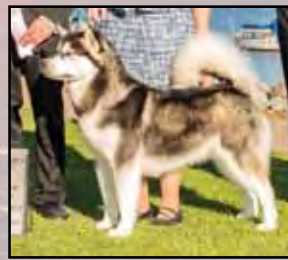
CH MAJESTIC'S GREY- ROCK WONDERFULLY WICKED (Hunyada & Hibern)