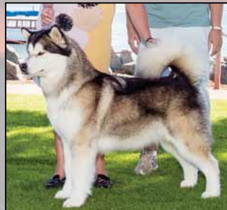
Reserve Winners Bitch: CH MYTUK'S GOOD GOLLY MISS MOLLY (Kler)