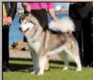
GCH WINTER PARK'S LOOK SHARP LIVE SMART (Park)