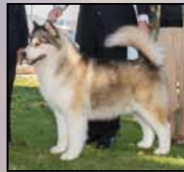
CH North Face Sno Klassic Glory Days (Peel)