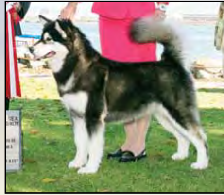
Best of Opposite: CH SPIRITRUN'S COOL RIDE, (Remazki/Syar)