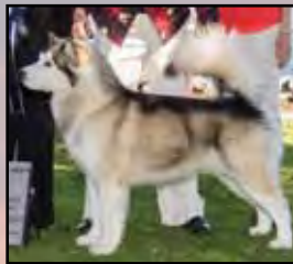
GCH Wolfmountain's Warhammer (Jenkins)