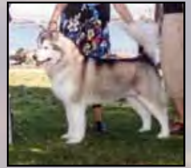
CH PACH Nanuke's Take It To The Bank CD RN MXGP MJGP T2BP (Corr)