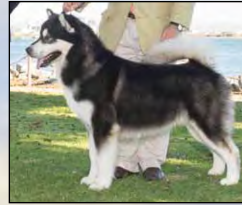
Select Dog: CH SILVERICE'S JAGER BOMB (Syar/Stone)