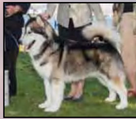
CH Onak's Living The Dream (Corr)