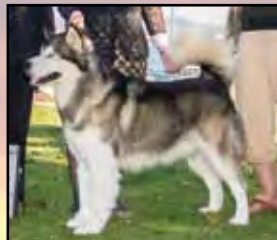
GCH Awanunas Tornado Of Snow BN WWPDA WWPDA (Pfeiffer)