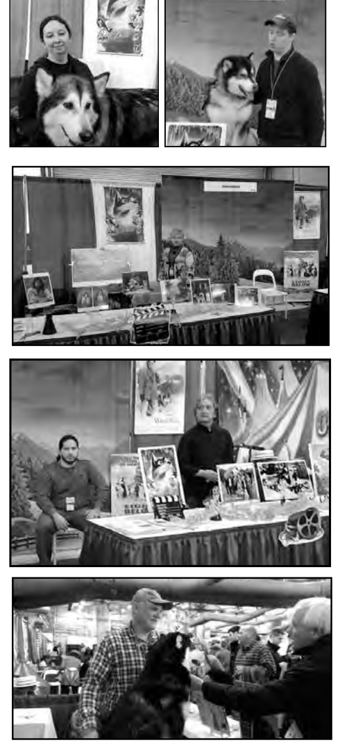
November/December 2017 Pg. 15