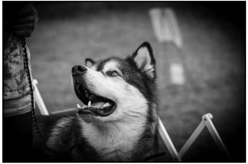
Arwah looking at me

When I have attention in public for several seconds with no distractions, I might go back to my house to increase distractions and reduce the amount of