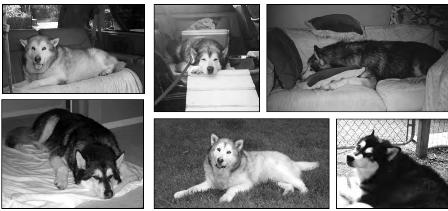
Pg. 28 November/December 2017

change of direction or pace and watch for opportunities to reinforce your dog for looking at you. Break into a run and when your dog is watching you, release him to a toy. Or, do a s-l-o-w pace and release/play for attention.