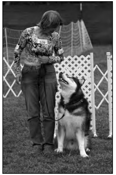
Warm up for Turbo prior to going in the ring for rally

and you should already have decided how you want to deal with this. If you do not add a consequence, then watching or looking away will become optional. Consequences or 'corrections' can be as mild or severe as you choose, or hopefully, as is appropriate for your individual dog. All dogs are different. While some are emotionally 'soft,'