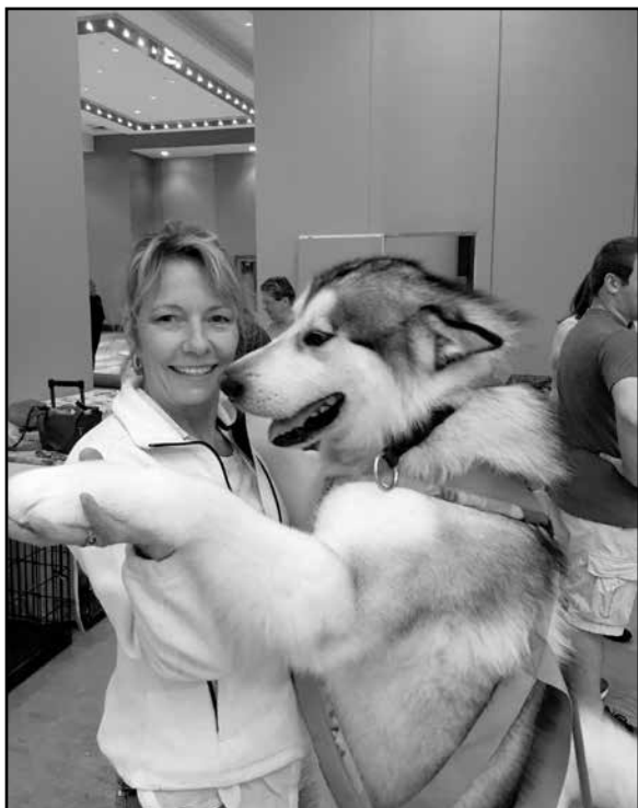
Winning Highest Percentage at 2018 National Weight Pull