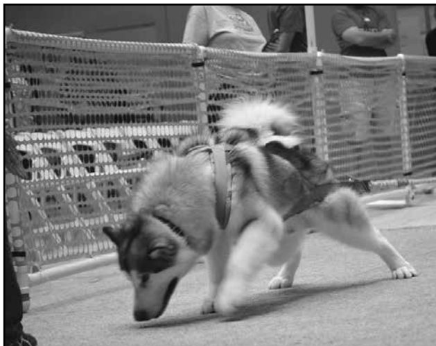
Shogun Working Hard!!

TRU NORTH KENNELS Northern Colorado www.trunorthkennels.com