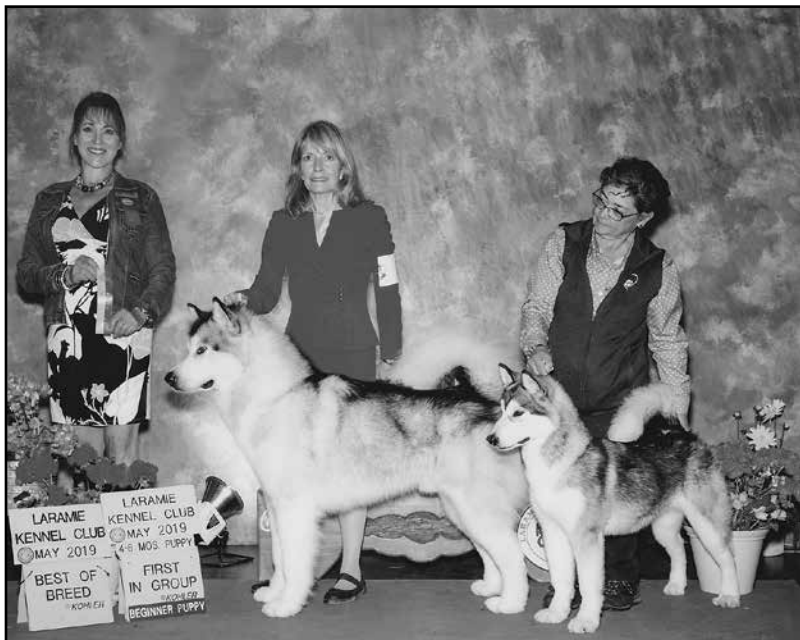
Shogun Winning BOB, with his daughter, Tru North's She's My Lucky Charm, who won Puppy Working Group