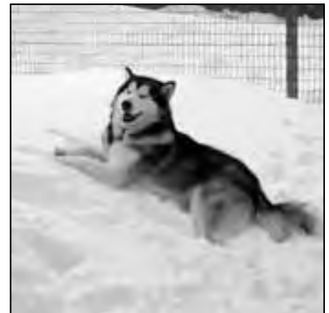
Awwwww.....This is the life.