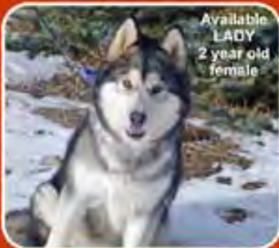
Available LADY 2 year old female