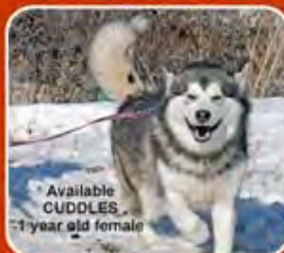
Available CUDDLES 1 year old female