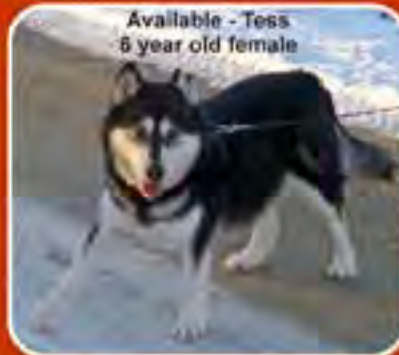
Available - Tess 8 year old female