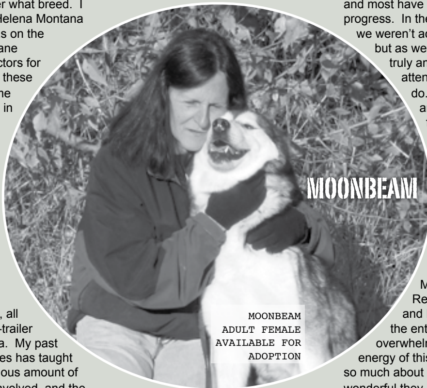
MOONBEAM ADULT FEMALE AVAILABLE FOR ADOPTION

dogs, we were hooked. We just couldn't stay away, knowing that they were sitting in their pens waiting to go outside. My sister and I were not used to malamutes, and it was daunting knowing that we had to go into each pen to try to put collars on very energetic dogs. Sometimes we would have to help each other, but one way or another, we got the job done.