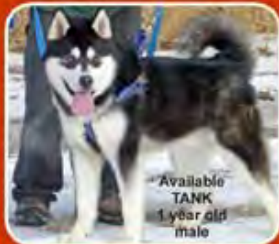
Available TANK 1 year old male