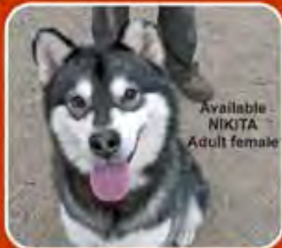
Available - NIKITA Adult female