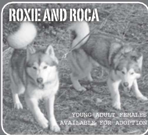
ROXIE AND ROCA

Words cannot express how touched and honored I am to be acknowledged by the malamute rescue community with the Christenson Memorial Award. There are so many good people working every day to better the lives of these wonderful dogs. I am proud to be a part of it all.