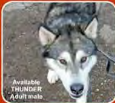
Available THUNDER Adult male