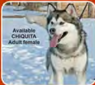
Available CHIQUITA Adult female