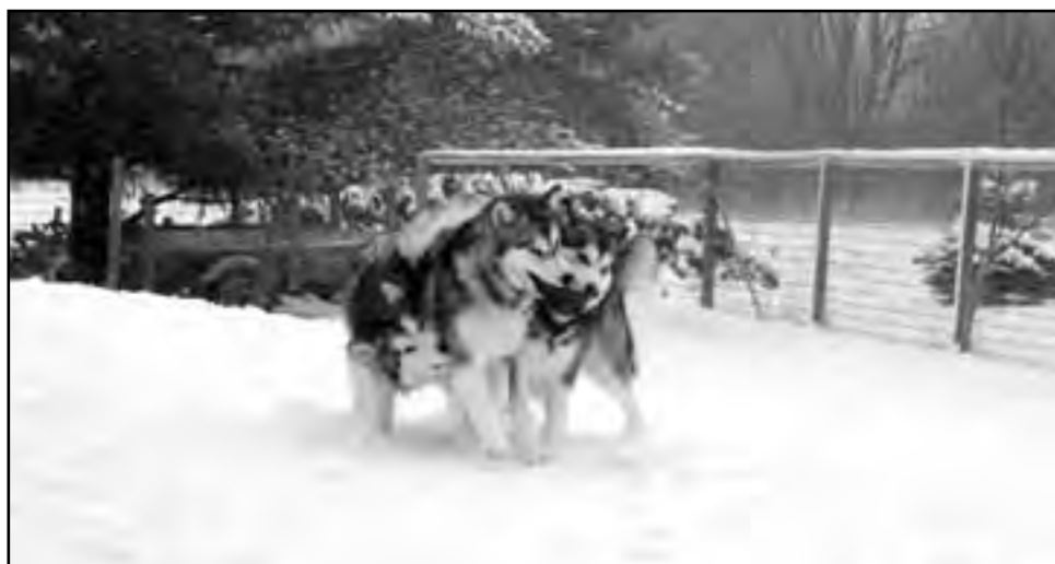
How many dogs?

And I responded to the usual many requests for rule clarifications and information.