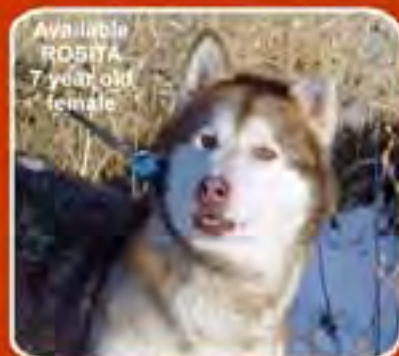
Available ROBYN 7 year old female