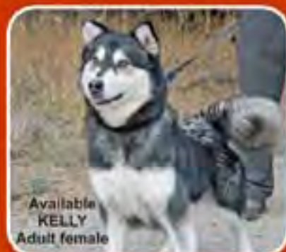
Available KELLY Adult female