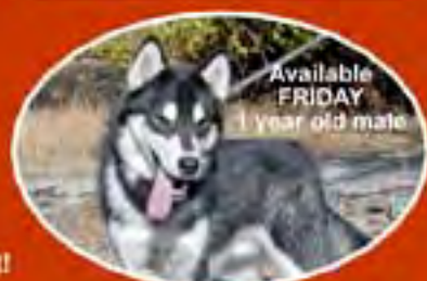
Available FRIDAY 1 year old male

Email montanamalamuteseizure@gmail.com to adopt / foster / transport!