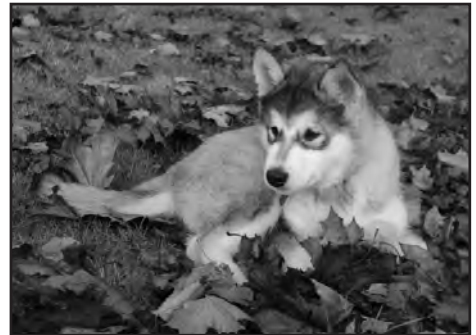
This leaf pile is history.