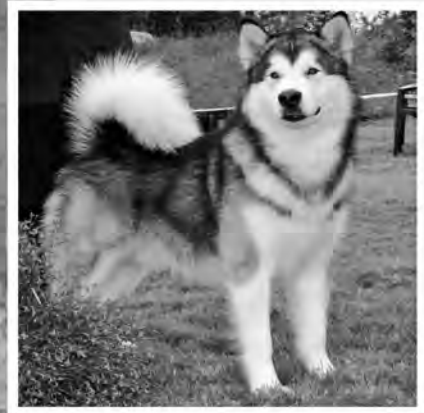
LEFT: DUTCH/INT'L CH KATAUM INUA'S TIKITTUNGA (FEMALE).