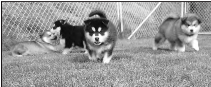
Did someone say DINNER?