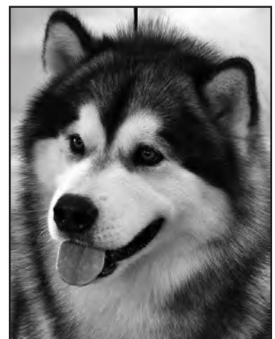
Ain't I purtty?