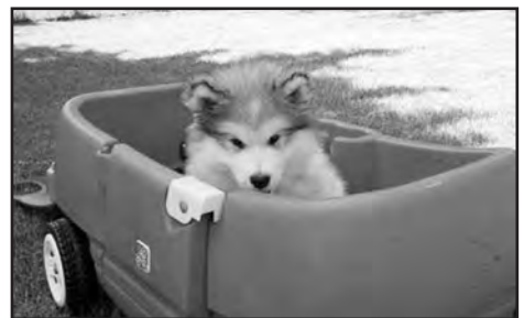
Where's my sled team?