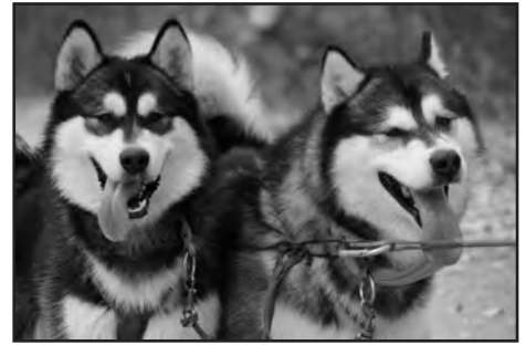
Where's the snow?